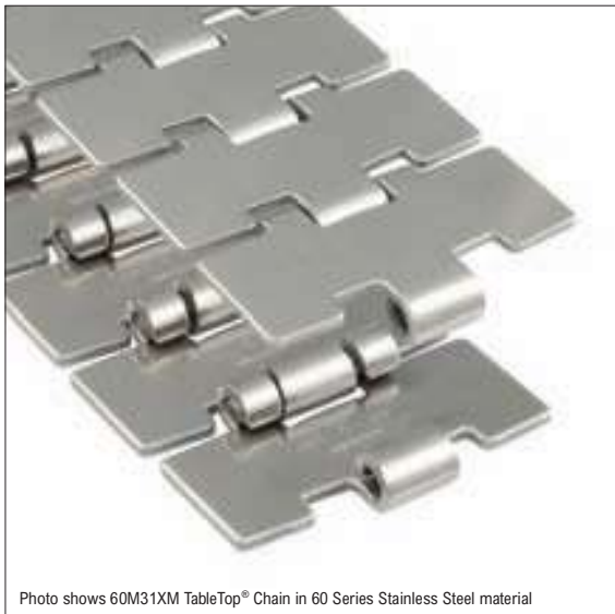
Photo shows 60M31XM TableTop® Chain in 60 Series Stainless Steel material