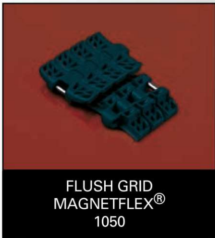
FLUSH GRID MAGNETFLEX® 1050